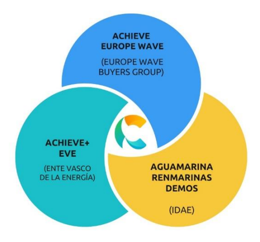
ACHIEVE Programme Schematic

RENMARINAS Demos Programme (AGUAMARINA Project) and the Basque Government through a grant from the Ente Vasco de la Energia (ACHIEVE+ Project).