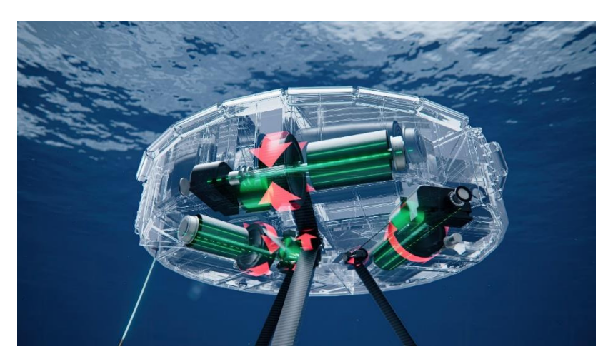
CETO internal illustration

Through this collaborative initiative, Carnegie will deploy and operate a CETO prototype at the Basque Marine Energy Platform (BiMEP) in the Basque Country, Spain, commencing in 2025, marking a key step on CETO's commercialisation pathway. The CETO Unit will operate for 2 years in this open ocean site and the data collected will be used to validate the performance of the CETO technology and propel it along the commercialisation pathway.