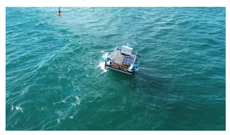
MoorPower in operation in significant sea states at the offshore test site in North Fremantle, WA

conditions. Due to recent inclement weather and wave conditions at the testing site, the Demonstrator was brought back to site at Carnegie's onshore testing facility in July. The team continues to analyse the gathered winter data to further validate the numerical models and support the commercial roll out of the technology.